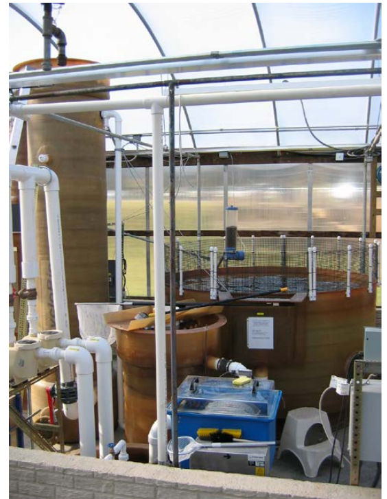
An individual RAS tank as part of the series of tanks used during this nitrate nitrogen study.

The aquaculture industry is working hard to stay ahead of activist groups who are beginning to set their sights on fish production after attacks on poultry, hog, dairy and beef production, Davidson notes – understanding the appropriate levels of nitrate nitrogen and other parameters will be a vital step in maintaining fish welfare standards that can withstand outside scrutiny.