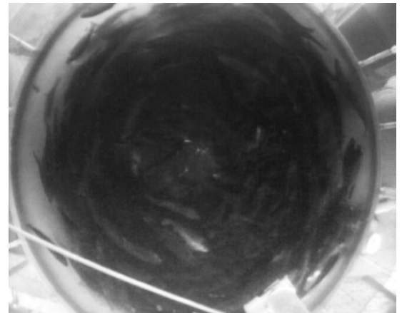
High-exchange RAS with few side swimming rainbow trout. Davidson et al., 2011. Aquacultural Engineering 45, 109-117.

“The Pro Plus was easy to use and calibration of the nitrate probe was simple and straightforward.”