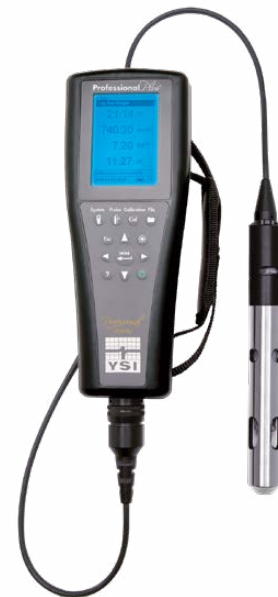
The YSI Pro Plus was used during the studies to acquire fast, simple field measurements of nitrate nitrogen.

For YSI specifications, visit: YSI.com or YSI.com/ProPlus .