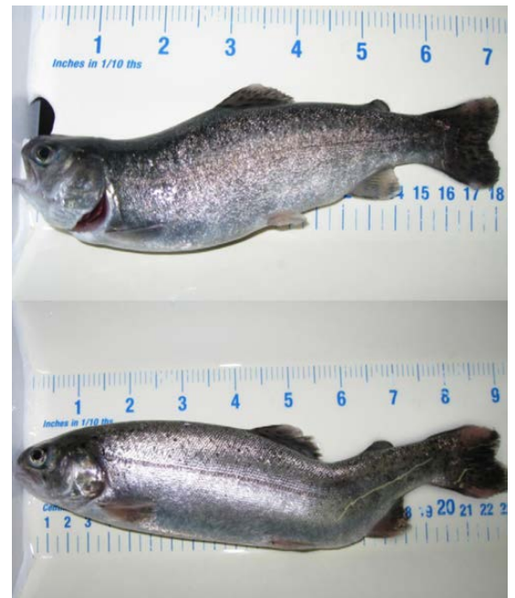
Examples of skeletal deformities observed in rainbow trout cultured within near-zero exchange RAS. Davidson et al., 2011. Aquacultural Engineering 45, 109-117.